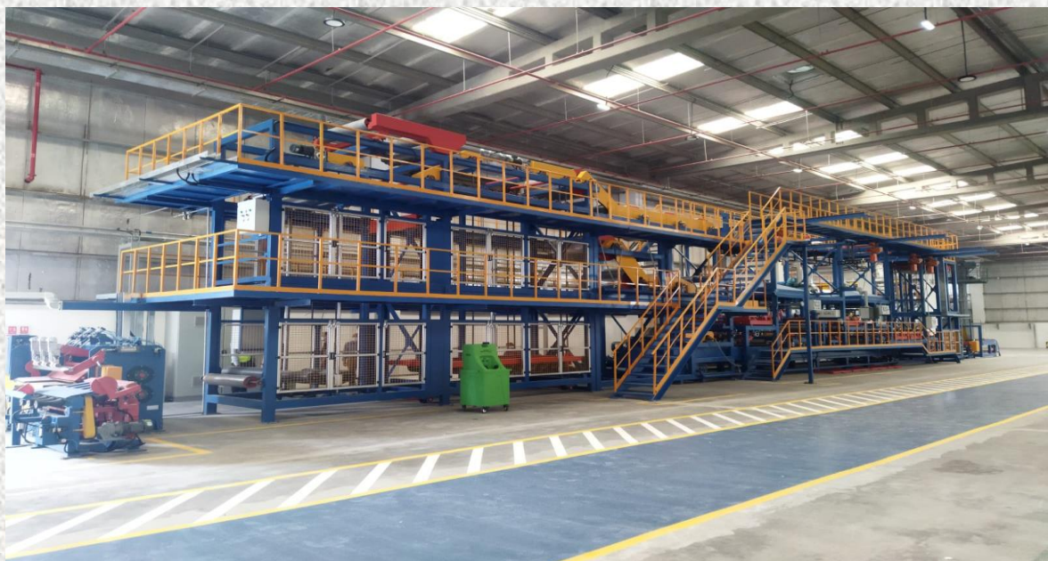
M/s. ARISTA Construction Systems Fze - Conversion of warehouse to Proposed factory and additional services @ Plot #S11008 - JAFZA