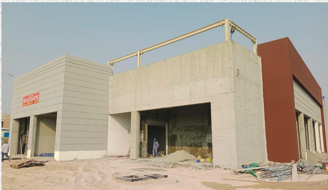
Commercial Building @ DIP 1 for M/s. Penrose Management DWC-LLC