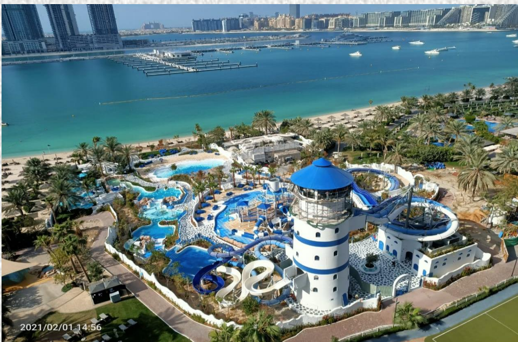
Jungle Bay Water Theme Park on Plot No. 3925304, Marsa Dubai - M/s. Westin Mina Seyahi Beach Resort.