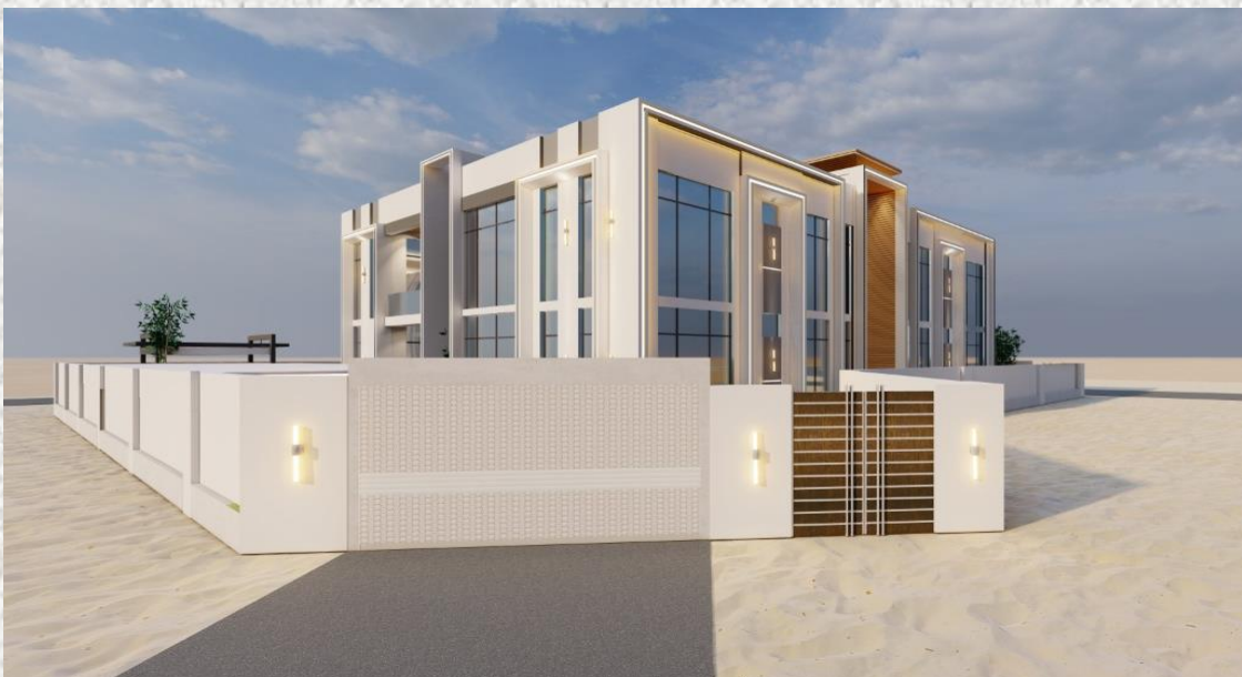
Construction of G+1+R Villa (13,000 Sq.Ft.) for HALGROAD Ltd.@ Saih Shuaib 1, Dubai