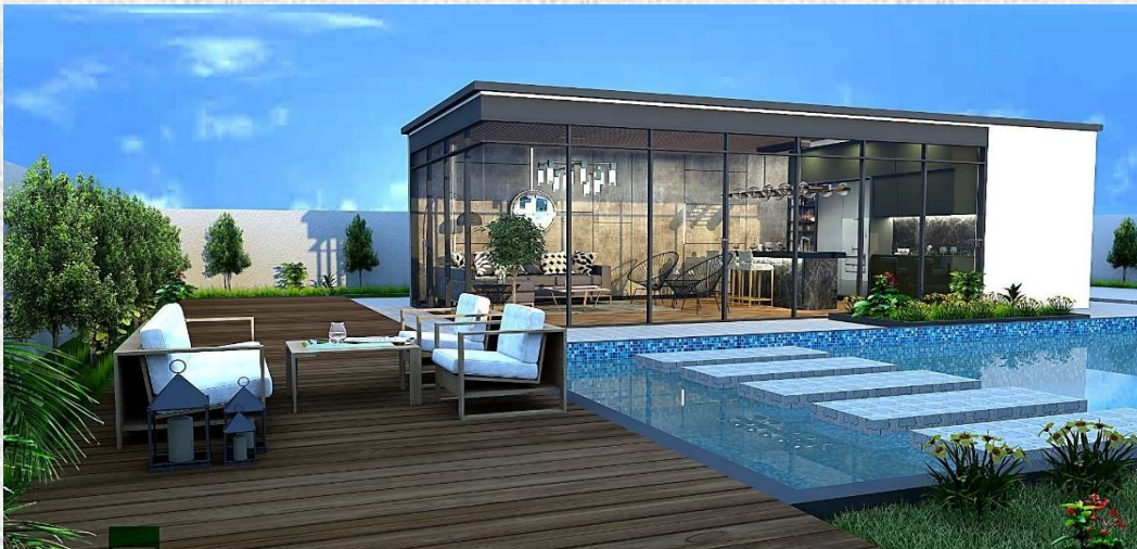
Plot No. 3471057 Al Merkadh – Club House for M/s. Noaf Interiors