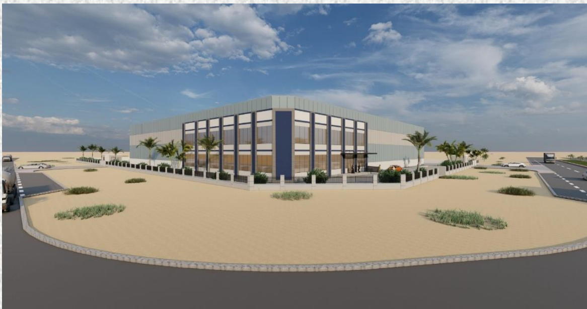
Proposed G+M Office, Workshop, Warehouse & Allied services for SOS Master Oil Collecting LLC @ DIC, Dubai