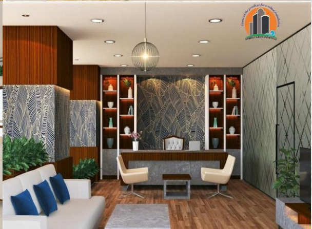
Office Fit out works.