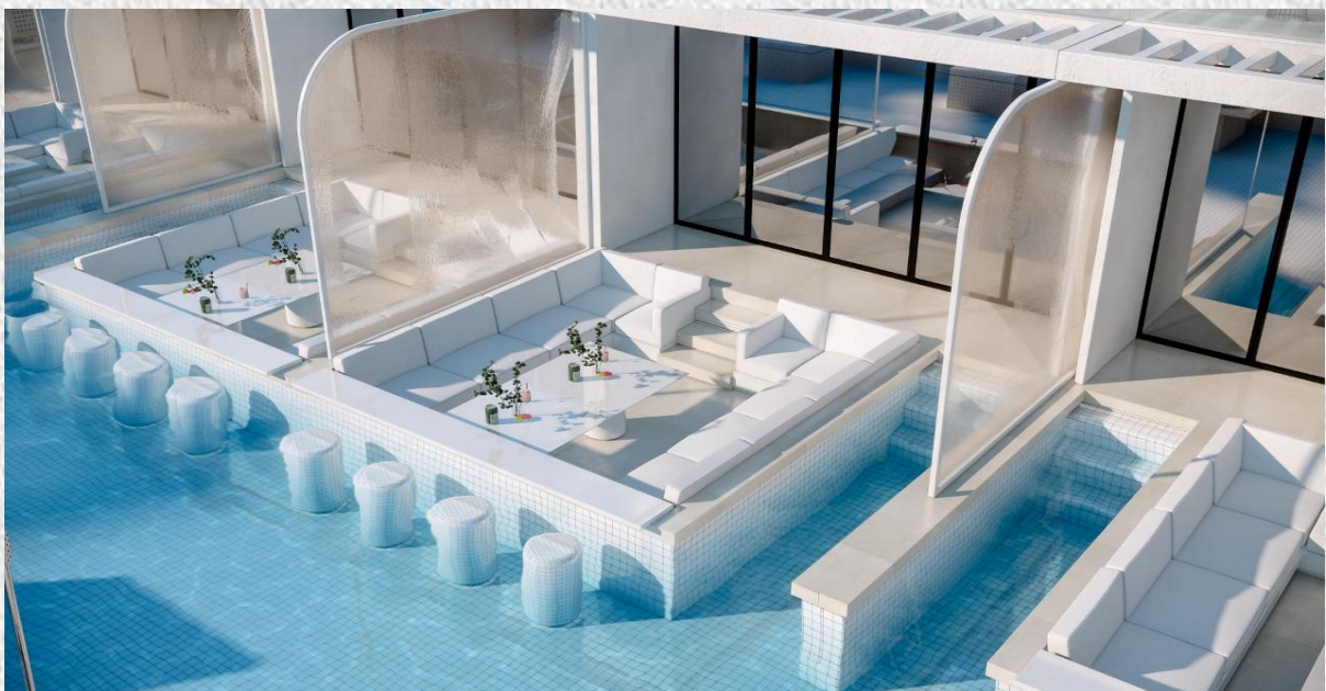
Civil Works for BCH Club for W Hotel – Palm Jumeirah (Main Cont.: Aujan Interiors)