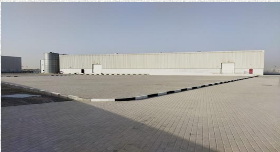
Warehouse and G+M Office block and allied MEP and Fire Protection works on Plot#S60307- JAFZA