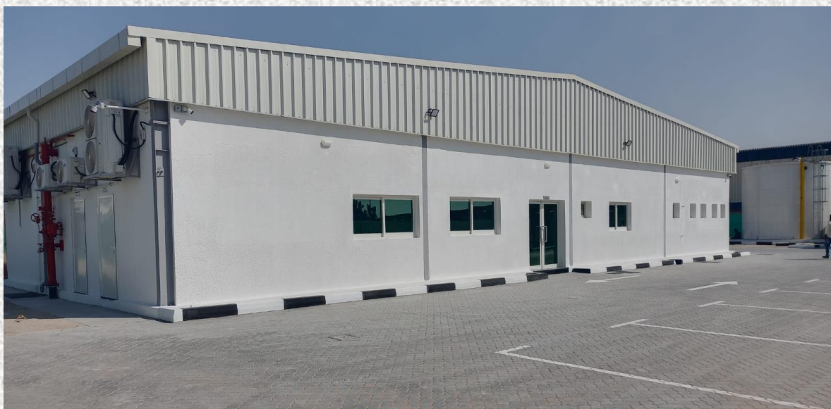
Warehouse and Office Block for M /s Terra Firma FZE at JAFZA on Plot # MO0108