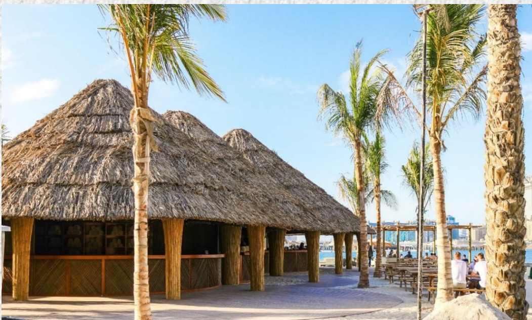
Beach shack in Barasti Beach Resort – Le Meridien, Jumeirah