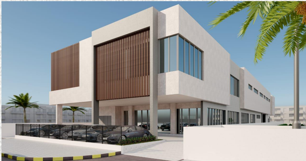
Plot No. DIP 1 – 5980105 – Commercial Building (Shopping Mall) for M/s. Penrose Management DWC-LLC