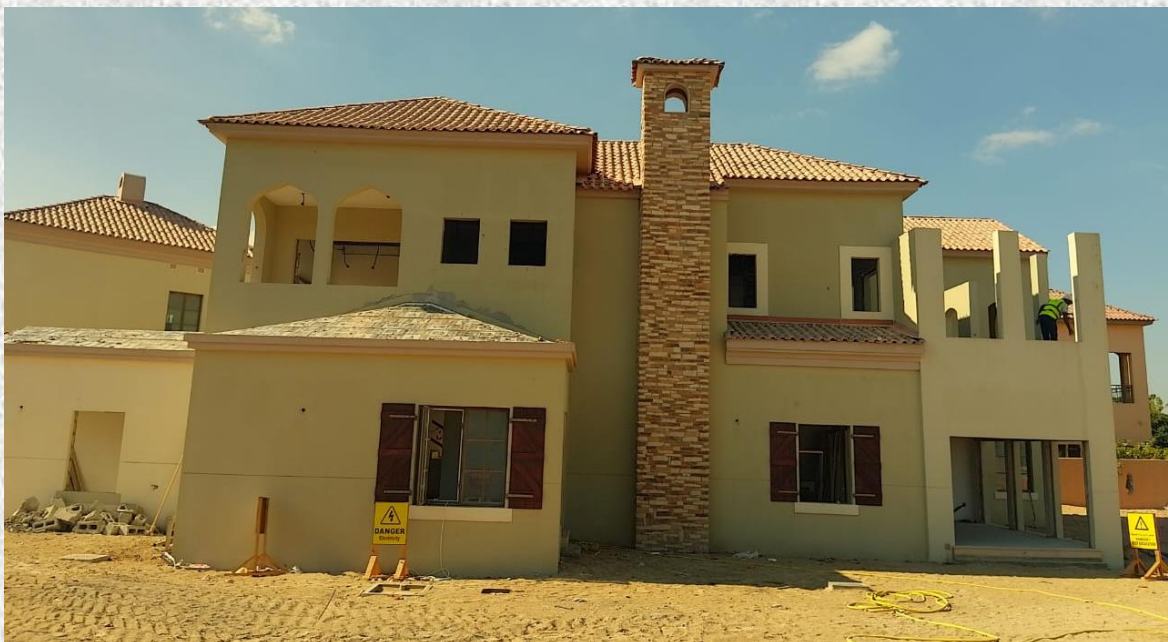
Extension and Modification of Exi. Luxury Villa including and MEP Works on Plot No.JGE- RW-AV-V011, ME'AISEM First, Jumeirah Golf Estates