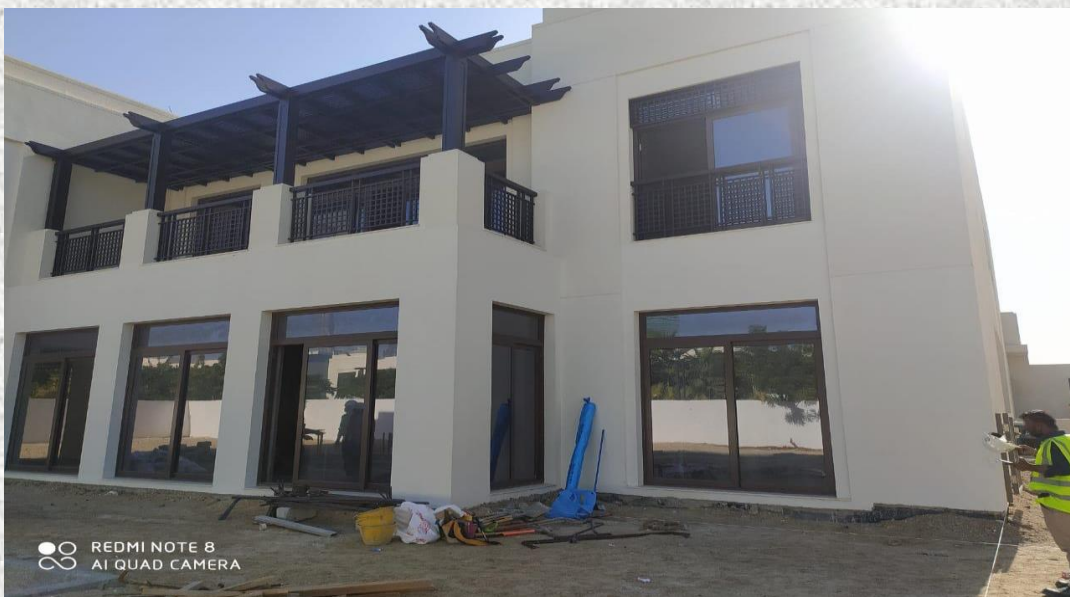
Savjani Villa @ Al Maktoum City - District 1 - Phase 1 - (C/o Noaf Interiors).