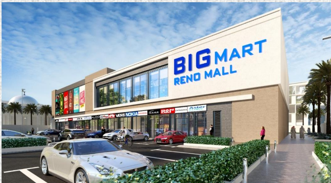
Plot #2450345, Muhaisnah - Construction of G+M Hypermarket for Big Mart – Reno Mall