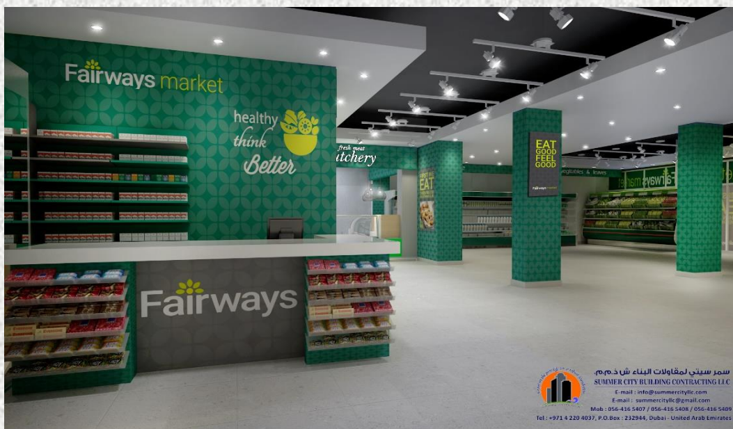
Plot No. IC1-MOR-I03 – Interior Fit out Works for M/s. Fairways Supermarket